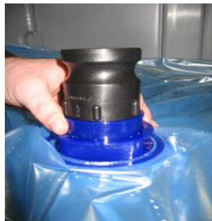
Cam adaptor attached.