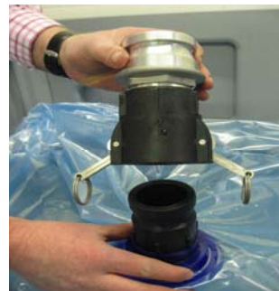
Attach cam lock to adaptor and secure by lifting the locking arms.