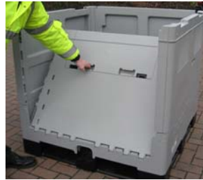
Make sure each panel is firmly locked into position.