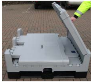
Using the side handles raise each side panel one at a time.