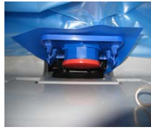
Make sure you locate the clip surrounding the outlet port on liner securely into the Combo's outlet port.