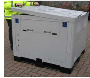
Replace Combo lid after filling and move locking handles into closed position.