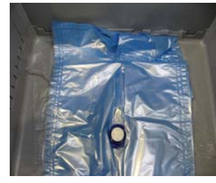
Ensure the inlet port is on the top of the liner. Do not unfold the liner. Begin to fill. The only adjustment required during the fill is to ensure the corners of the liners are pulled towards the corners of the box.