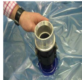
Hose fill adaptor needs to be screwed into cam lock to complete fitting.