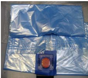
Place folded liner in the bottom of the Combo, ensuring the outlet port on liner is next to the outlet port on Combo.