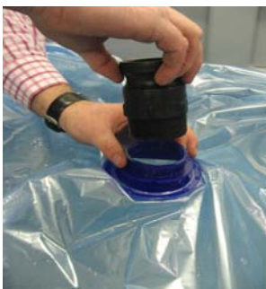
Attach the 2" cam adaptor to the inlet port at the top of the liner.