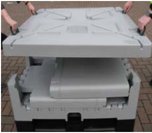
Remove lid by lifting the locking handles and sliding towards the centre.